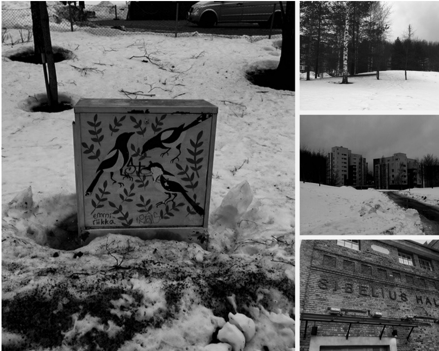
FIGURE 3.1 Simon’s walk.

[Simon] On a tour of the building we were asked if anyone wished to sing. I shouted “yes please!”, walked to the conductor’s podium and turned to face the vast space and sang the acapella introduction to a song I wrote called “revelation”, followed by the first verse of “sparrows on the roof”. These were significant moments,