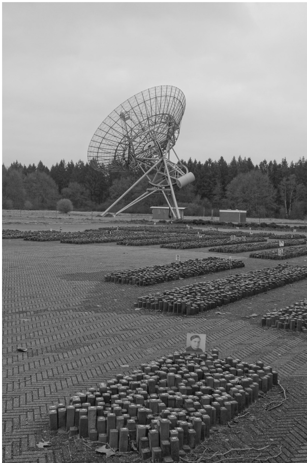
FIGURE 1.1 Part of the forest around the former campground in Camp Westerbork has been cleared for a field of radio telescopes. These telescopes, placed next to the memorial to the camp's victims, are visible from the site of the former camp, contributing to the bizarre experience of different worlds meeting.

Later when walking in the museums, the forest and around the now demolished camp and reading and hearing the heartbreaking personal stories of the people who had passed through it, in the back of my mind I kept hearing laughter. It was the laughter of the Moluccan children whose families had been forced out