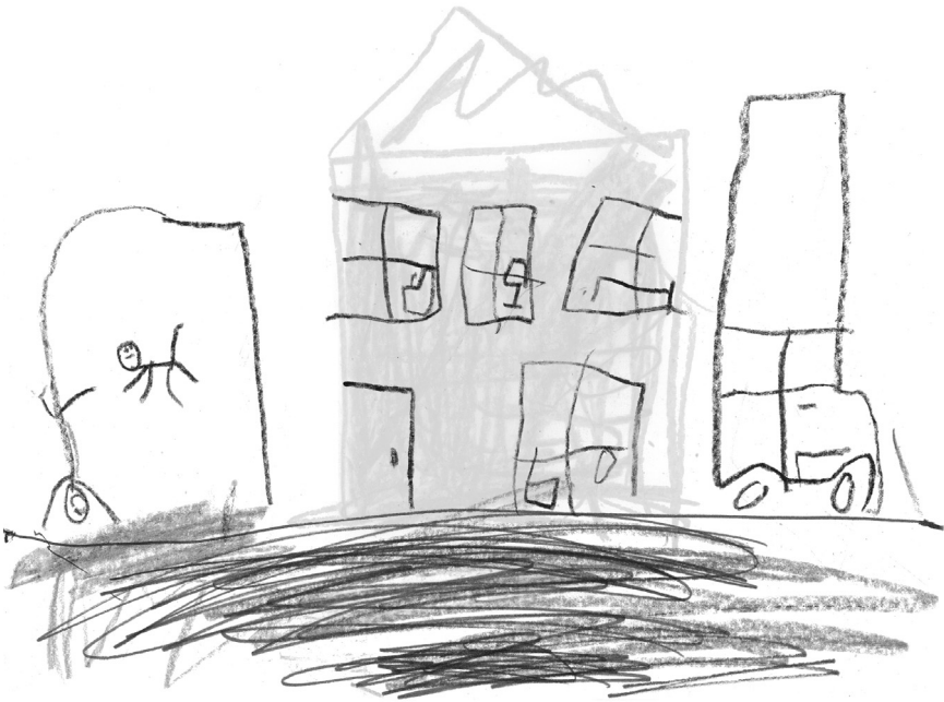
FIGURE 6.2 Drawing by an 8-year-old boy, 2018.