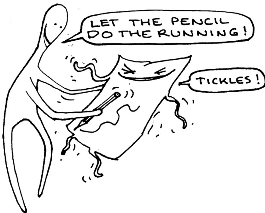
FIGURE 7.3 Drawing by Marika Tervahartiala, 2019. Copyright: Marika Tervahartiala

Autoethnographic drawing accepts conflicting and overlapping readings. While the autoethnographer has to be willing to rely on Drawing, the reader/viewer is asked to give up on searching for the sole and “true” drawer’s intentions. If the reader/viewer is able to let go and give up on the quest for sole intended message, possibilities for myriads of interpretative perspectives and, even processes of invention arise. They vary and multiply by every reader and reading and by shifting contexts, they create infinite kaleidoscopic possibilities, displacements and replacements. Thus, giving up becomes drawing out, the visual dialogue between the Drawing and the drawer then becomes a triologue. The autoethnographical drawing desires to be a tempting invitation for a reader/viewer to a dialogical journey as through this journey the Drawing gain infinite possibilities for more lives.