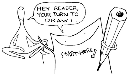
FIGURE 7.5 Drawings by Marika Tervahartiala, 2019, layout by Maria Manner. Copyright: Marika Tervahartiala

If image no longer illustrates the words (Barthes 1984, 25), the freedom to create forms of representation that are in harmony with authentic experience, unique abilities and skills, is highly important. This is a significant and meaningful shift not only to the researcher but also to achieve the full potential of the research for/with the readers (see Four arrows 2008, 4). Transformation in readers (Berry and Patti 2015, 265) may be too ambitious goal to draw out. An achievable aim may be to (re)imagine a more autoethnographic and holistic academic life, an inclusive life built on less restrictive ontologies and epistemologies. In the personal change, the development of insights and knowing would be more curious, explorative and open to trouble, discomfort, unknown and uncertain and as a result become more knowing, 'certain', accepting and limitless.