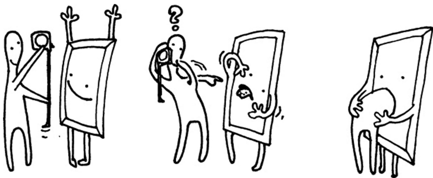
FIGURE 7.1 Drawing by Marika Tervahartiala, 2019. Copyright: Marika Tervahartiala

The presented research started as a drawn autoethnography focusing on drawing as a method. Surprisingly, outlining the autoethnographic drawing process revealed it to not only be the drawer's autoethnography but also the drawing processes autoethnography of itself and then, in turn, about the drawer. As I draw, the autoethnography, my processes, the drawing sketches me into being. These mutual acts gave rise to an attempt at a methodological approach where the drawing is an inseparable part of all the stages and iterations of the visual autoethnographic research process. Post-disciplinary as well as post-structuralistic approaches are needed to unveil and enlighten the possibilities of drawing as methodology and theory as practice (Irwin and Springgay 2008, 106). The autoethnographic drawing as a methodology is located within the umbrella of autoethnographic methodology that uses the researcher's personal experience as data to describe, analyse and