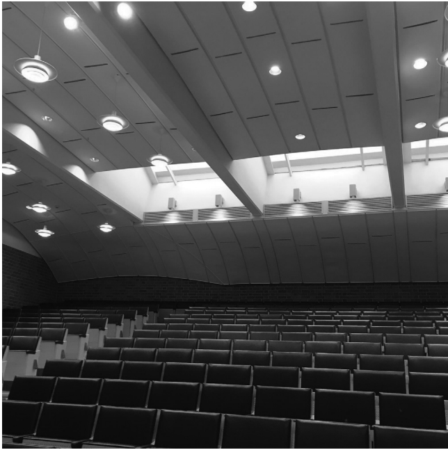
FIGURE 2.1 Conference venue.

perceptual engagement of emplacement (Feld 2005, 181; Österlund-Pötzsch 2008, 117). It also forms kinesthetic (sensation of movement) and proprioceptive (awareness of the position of one's body) knowledge that constitute many everyday-life routines and tasks (see e.g. Tiili 2016, 34; O'Dell 2004). One means of doing sensory ethnography is to walk specific routes and perceiving the environment (e.g. Österlund-Pötzsch 2008), or to practice accompanied walk-along-ethnography in the form of a sensory memory walks , during which the participants share sensory memories attached to place (e.g. Järviluoma and Vikman 2013; Aula 2018). We encouraged the workshop participants to reflect on their memories, and a few of them mentioned that sensory perceptions triggered memories of similar places: