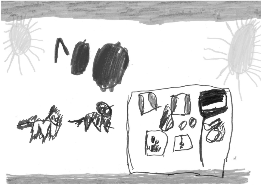
FIGURE 6.3 Drawing by a 6-year-old girl, 2018.