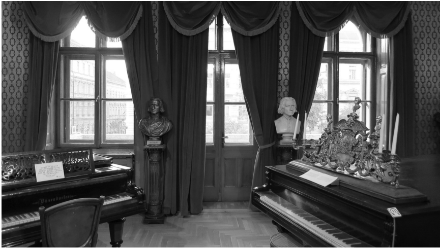
FIGURE 1.2 The view from the living room in the Franz Liszt Memorial Museum in Budapest.