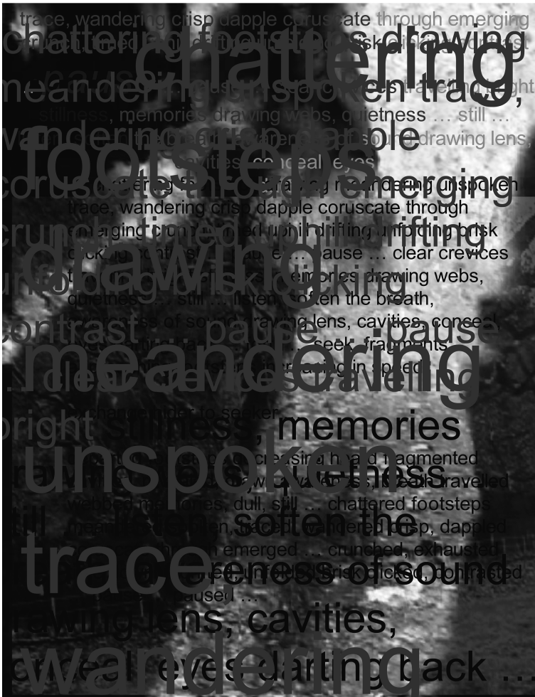
FIGURE 7.1 humhyphenhum (Deborah Harty and Phil Sawdon), The Taste of Tree? Layer 3 Digital Drawing 2 , 2011. © Deborah Harty and Phil Sawdon. Courtesy the artists.

direction of taste, but they are nevertheless exemplifications of the inter-sensory or inter-modal shifts that constitute the body schema in Merleau-Ponty's phenomenology.