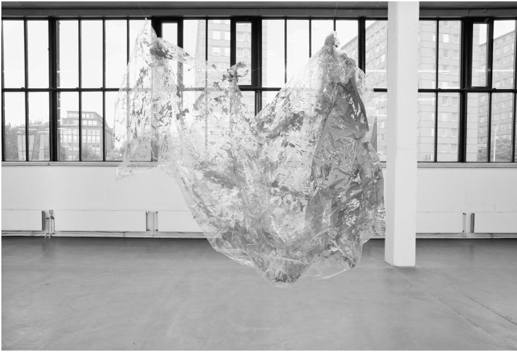
FIGURE 3.1 Karla Black, Pleaser , 2009. Cellophane, paint, Sellotape, thread, 250 x 200 cm. © Karla Black. Courtesy Galerie Gisela Capitain, Cologne. Photograph © Fred Dott.

For the moment, let us focus on how the sculpture illustrates the role concepts play in experience. Pleaser is a good example not just because it has already been discussed in terms of research, but also because it is made of cheap materials arranged in ways that look crumpled, and therefore could easily be dismissed as an unwanted, discarded item. So the first salient, conceptual point to note is context: this crumpled mass of cellophane, Sellotape, thread and paint is encountered in an art gallery and not in the corner of a back alley. But what is ordinarily called ‘context’ is also an illustration of the Kantian point that we approach a situation through the lens of a particular concept. The concept of ‘art’ is playing a major role in determining how the material is perceived, although exactly how it determines perception is far from clear, since the nature and meaning of art after conceptual art is no longer straightforward (I explore the implications of this for artistic research in chapter 8). It could be argued then that the mass of cellophane, Sellotape, thread and paint is approached in a way where there is some recognition of the materials but there is also uncertainty as regards what to make of them in an art context.