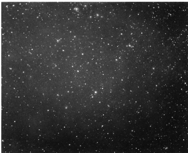
FIGURE 5.1 Vija Celmins, Night Sky #19 , 1998. Charcoal on paper, 57.0 x 67.3 cm. © Vija Celmins. Courtesy Matthew Marks Gallery, New York. Photograph © Tate, London 2016.

white of the paper that becomes the basis for a relationship between charcoal dust and the emission of light from distant galaxies. This might seem to be not the most inventive relationship. Doesn't it just amount to saying 'more charcoal' equals 'less light' which could easily be achieved through careful shading with a charcoal stick? No, because the slow, accumulative rubbing of the charcoal into the paper and the precise, delicate acts of erasure, to the point where Celmins is working with charcoal as specks of dust, create senses of the calibrated and the particulate that interact with ideas of the celestial and the astronomical more strongly than any simple, repeated act of shading. Here we can see how the articulacy of material and metaphor work in tandem: the manipulation of materials, carried out in response to a photograph of a night sky, creates particular effects – subtle shifts in tone, specks of charcoal dust, spots of intense white – that call for description, and concepts are drawn from the field of associations surrounding the night sky.