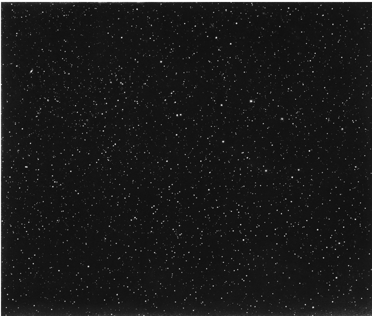
FIGURE 5.2 Vija Celmins, Night Sky #18 , 1998. Charcoal on paper, 48.5 x 58.5 cm. © Vija Celmins. Courtesy Matthew Marks Gallery, New York. Photograph © Tate, London 2016.