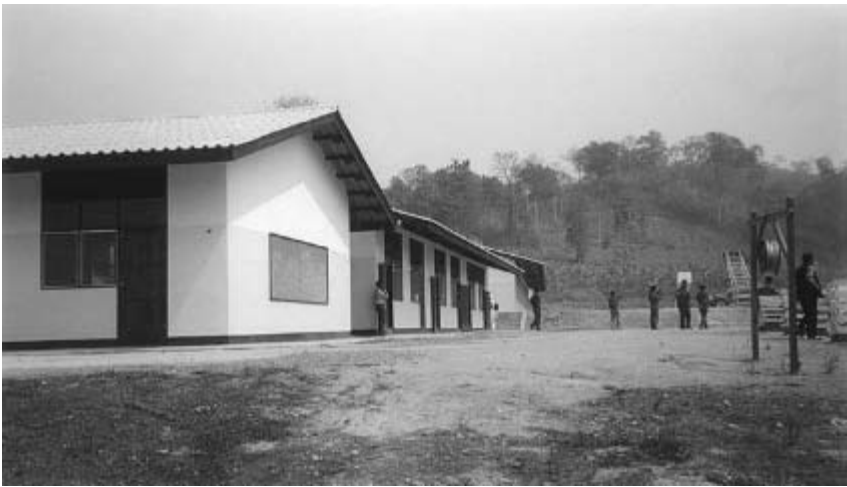
Plate 3.17 Yong Kha school and school bell made from wheel hub.

There is no doubt that all the players are conscious of the hardship involved in accomplishing the changeover to a non-poppy economy, with government sources frequently reporting on the distribution of free rice, salt, agricultural seeds, livestock and household items to the former poppy farmers who have handed over poppy seeds and participated in the crop-substitution programme (Myanmar Information Sheet No. D-3018 (I) 3rd May, 2004). Following the March 2004