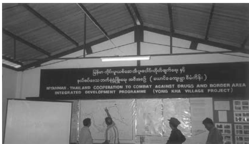
Plate 3.15 Yong Kha village project.