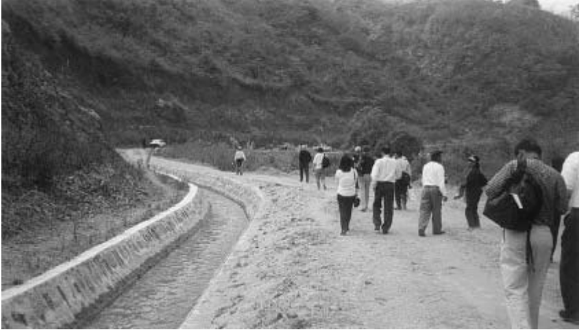
Plate 3.23 UNODC funded water viaduct for rice fields – Mong Ka.

Provision of the necessary infrastructure to support the economic and social transformation in these border regions has therefore been an essential policy initiative. Recognition of the impact of infrastructure-provision strategies in promoting pro-poor growth and the significance of interweaving national and sub-national relationships with initiatives taken in the international community were key aspects of the discussions at the World Bank's seminars on 'Poverty Day' October 2003 when it was acknowledged that such an approach contributes to realization of the Millennium Development Goals. From this perspective, the policy initiatives by the Myanmar government, through the CCDAC and the Ministry for the Progress of Border Areas and National Races and Development Affairs, in cooperation with the leadership of the ceasefire groups, are consistent with policy principles for effective poverty alleviation espoused by this key international agency.