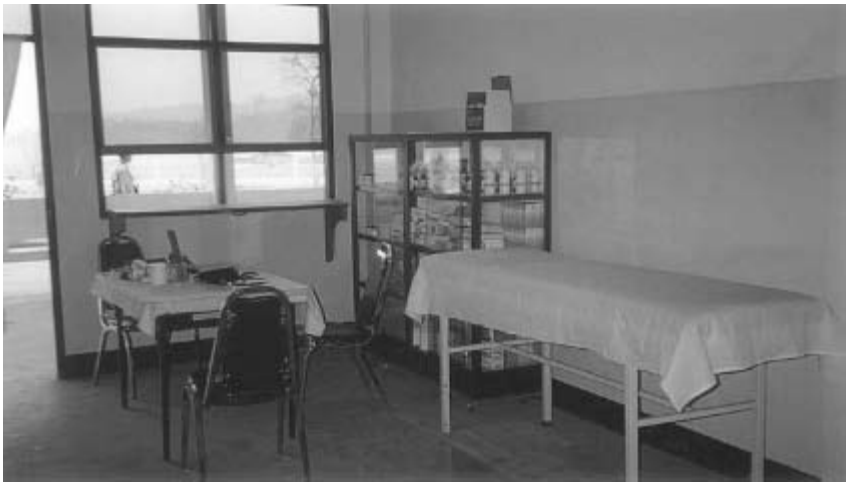
Plate 3.19 Patient examination room Yong Kha hospital.

opium yield survey with its apparently satisfactory results, it was reported that Thailand was providing further funding of 30 million baht (or about USD 700,000 on top of the 40 million baht – USD 960,000, already invested in the crop-substitution programme) for additional poppy substitution and infrastructure projects in villages outside Yong Kha in south-eastern Shan State (Plate 3.22). This two-way cooperation with Thailand, which has a significant vested interest in ensuring the interdiction of the drug trade flowing into its territories