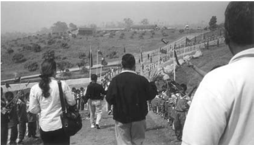
Plate 3.14 Welcome by children, Wan Hong poppy replacement project.