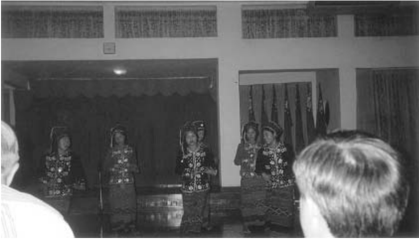
Plate 3.24 Lahu dancers Kengtung hotel (1).