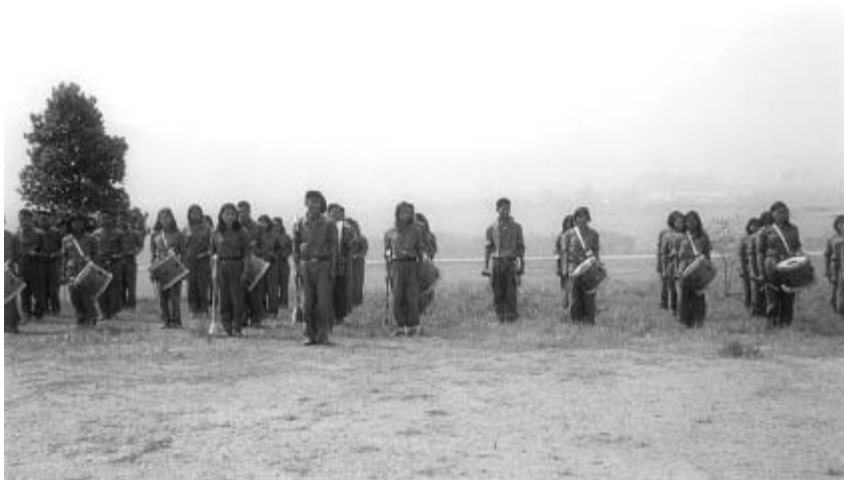
Plate 3.20 Young soldiers in the UWSA – Wan Hong welcome band.