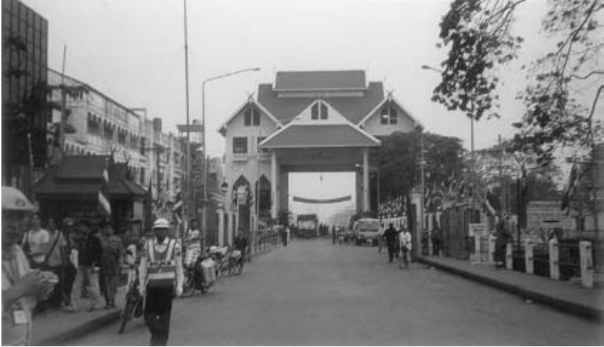
Plate 3.26 Tachilek–Mae Sai Border Gate, Thai–Myanmar Border.

systemic corruption which has been one of the legacies of the decades of civil war. In Taunggyi, Shan State, in early 2000, I witnessed a transaction taking place in the dimly lit foyer of the government hotel where my delegation was staying. That it was a clandestine transaction was obvious from the furtive glances and body language of those involved, a transaction which, for our own safety, we pretended not to see. Describing the overseas connections of the drug operations in Upper Myanmar, Lintner writes,