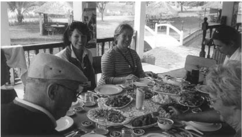
Plate 3.5 Lunch outside Kengtung.

whether this was ‘autonomy, or decentralization’ in practice, a government representative told me: ‘Not autonomy, not decentralization. The central government is working through the ethnic minority leaders, i.e. the Wa.’ However, it seemed quite apparent that actual control on the ground, at the local level was indeed in the hands of the Wa leadership, and that government forces, representatives, and international guests entered that locality by invitation – that is, government presence in