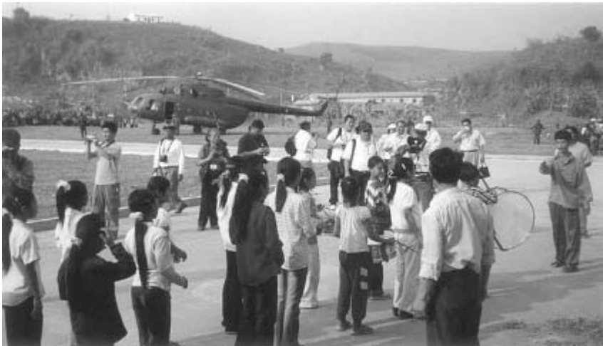
Plate 3.11 Mong Pyan welcome band, villagers and helicopter.

Curtis Lambrecht is therefore misguided in his analysis (2004: 151–81) of the relationship between the Myanmar government and the ceasefire groups. Not only does the government not ‘exert control over the border regions and populace to an extent that is historically unprecedented’ (Lambrecht 2004:172), but also it is clear to anyone who takes the trouble to go to these regions that government presence in the border regions, beyond the big towns, is a constantly re-negotiated entity. The Myanmar government does not have undisputed control of these areas. The indigenous ethnic minority leadership of the ceasefire groups negotiate the terms on which ‘development’ comes to the border regions, is implemented and distributed. Such regions are not criss-crossed by strategic highways such as those built by the US/Thai governments in North-East Thailand during the Vietnam War for express strategic purposes to facilitate transport of troops and weaponry destined for Vietnam. As one flies over the impenetrable mountainous areas of Myanmar, still largely pristine forests, such strategic highways are notable by their absence (Plates 3.11, 3.12 and 3.13). Such roads as there are, outside of the