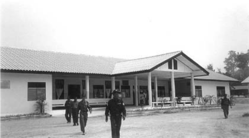
Plate 3.3 Front view of Yong Kha hospital.

Visiting 10 sites in Eastern Shan States in February 2004 where there was an official programme, with international support from UNODC (funded by Germany, Japan and the US), to replace the poppy culture with an economy of alternate cash crops (cashews, various rices, coffee, fruits, mixed farming) I was conscious that our party of 38 (mostly international visitors) was there very much by the grace of our ethnic minority hosts, the Wa leadership (Plates 3.4 and 3.5). Upon asking