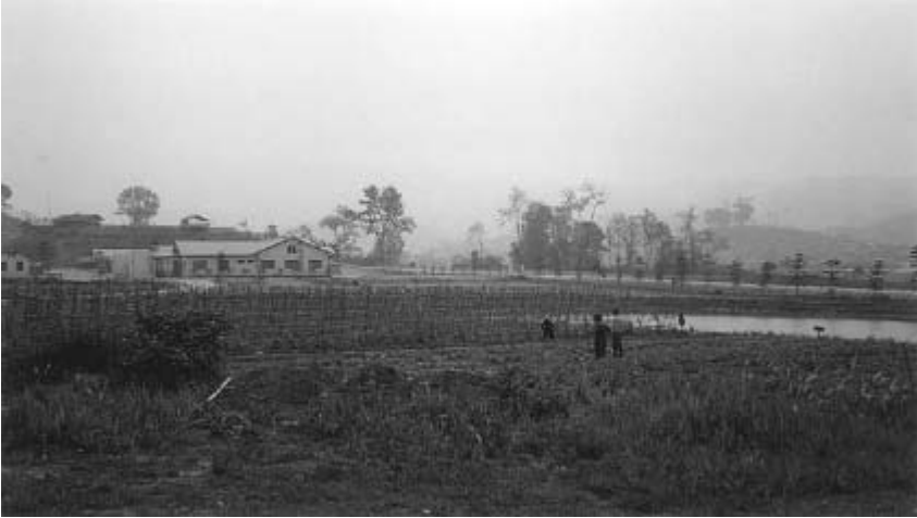
Plate 3.2 Yong Kha hospital and market gardens.