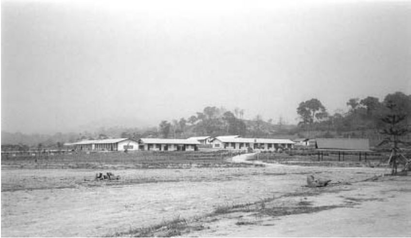
Plate 3.16 Yong Kha school and market gardens.