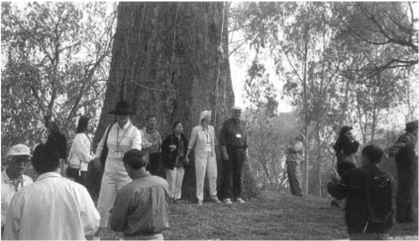
Plate 3.8 The tallest tree, 500 metres in height, Kengtung hill – used during civil war as target practice.

or subject to special qualifications and restrictions’ (Nolutshungu 1996: 17). Such peoples are ‘usually disadvantaged and oppressed’ ( ibid. : 19), undergoing the seven vectors of human insecurity (UNDP 1994: 25) – economic, food, health, environment, personal, community and political – as the primary life experience. In the words of David Laitin (1996: 37) ‘the livelihood of marginal populations is egregiously insecure’. For the ethnic populations who fought the 50-year civil war