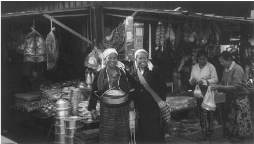
Plate 3.6 Ethnic minority (Shan) women, Kengtung market.

Asking 'Who is marginal?' Nolutshungu identifies marginal populations as 'distinguishable minorities within states whose integration to the society and state is markedly incomplete so that their participation either is partial or intermittent