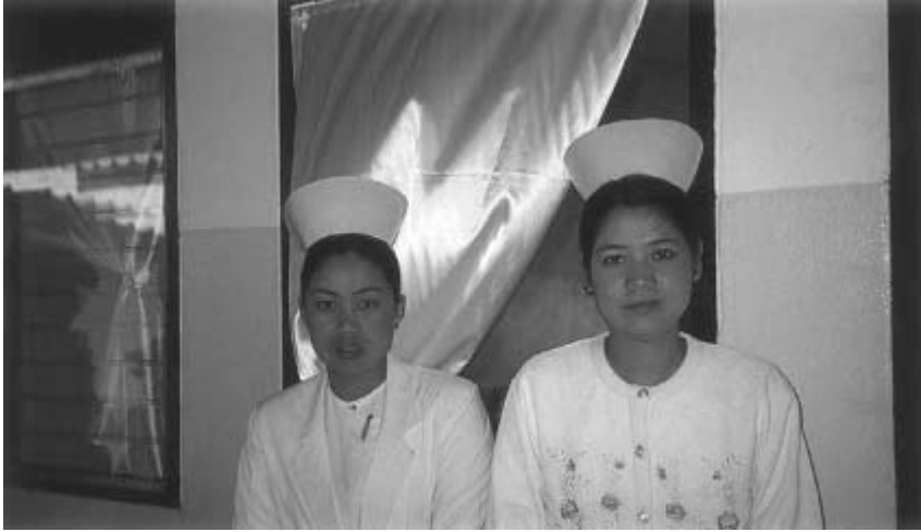
Plate 3.18 Nurses Yong Kha hospital.