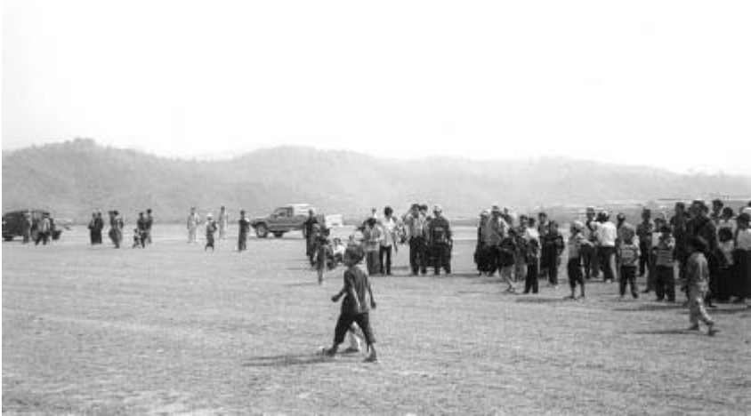
Plate 3.13 Mong Pyan truck and welcome (2).

towns and main north-south highway along the Ayeyarwaddy river corridor, are of poor quality, require four-wheel drive access, and are used mainly to transport produce to market. Many are unusable during the monsoon season, May–October. At Heho outside Taunggyi in Shan State in January 2000, I witnessed market day. Most of the agricultural produce had been brought over these unsealed arterial roads by ox-cart, some dozens of which, with their beasts of burden still in yoke, were parked behind the market stalls. At the present time, almost 50 per cent of