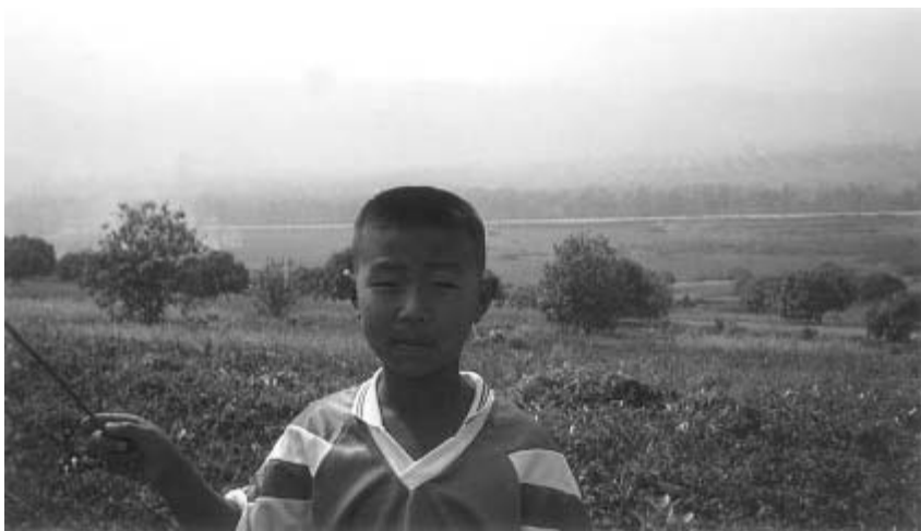
Plate 3.21 Welcome at Wan Hong poppy replacement project, showing fruit (Mandarin) trees, in background.

from Myanmar, includes provision for the former poppy farmers to be able to sell their new agricultural products duty-free across the border to Thailand. Not only is the rice deficit being addressed, but also now a surplus is available for export. 8 The cross-border trade is harnessing an economic boom in the border towns such as Tachilek. Local indigenous leaders told me that the internal export, within Myanmar and around the neighbouring countries bordering the Golden Triangle, 9