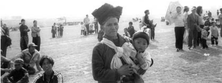
Plate 3.10 Villagers Mong Pyan (2).