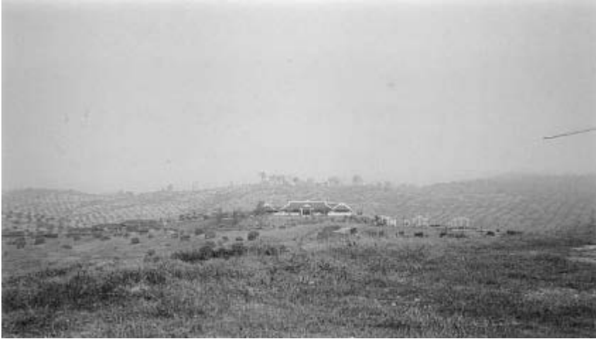
Plate 3.22 Provincial Headquarters, Wa Special Region No. 1, showing fruit orchards in background.

of surplus farm produce from the crop-substitution programmes had earned the participating communities a substantial income in the previous agricultural year.