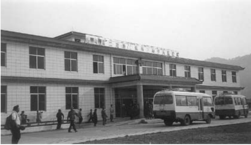
Plate 3.1 Mong Pauk hospital on Myanmar–China border.

Areas and National Races has been opened and a second one at historic Panglong. On a trip to the Eastern Shan States in February 2004 to inspect some of this infrastructure, I was struck by its newness, its apparent lack of use, pupils, or patients, but this may have been a temporary situation not indicative of the operations of the development programme at other sites (Plates 3.2 and 3.3). A 50-bed rehabilitation hospital for drug addicts at Mong Pauk, a site on the China border, for example, was well patronized, with most of the beds occupied by Shan-speaking patients undergoing detoxification. This hospital had been established with funding from China; it carries large Chinese characters on its front façade.