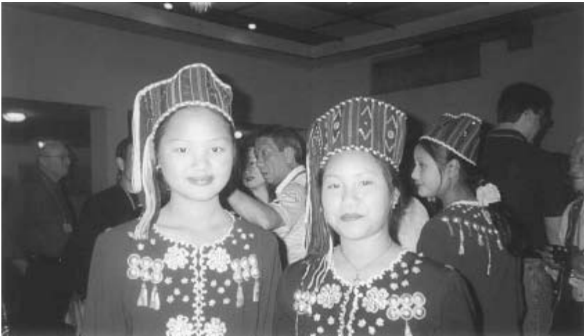
Plate 3.25 Lahu dancers Kengtung hotel (2).

opium among the Lahu, Lisu and Akha. They commented that the Lahu, of whom about 20,000 were then in Thailand, had migrated secretly from southern China and Burma, and were heavily involved in the drug trade. 'The Burmese army and Lahu are ferocious enemies and engage in merciless combat' (Boucard and Boucard 1992: 32); the Akha, an animist group with a strictly patriarchal social organization, practice 'poppy cultivation as one of their major activities' (ibid.); whilst the Lisu have long been associated with poppy cultivation as witnessed by