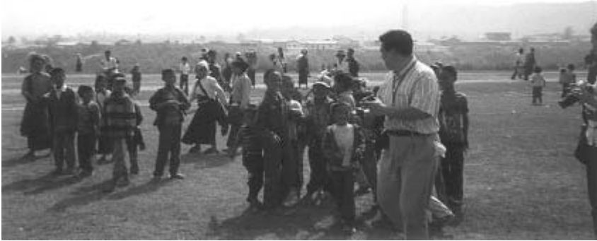
Plate 3.12 Mong Pyan truck and welcome (1).