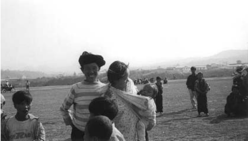
Plate 3.9 Villagers Mong Pyan (1).

a positive feature of indigenous peoples' lifeways and fundamental to maintaining their distinctive identities (Plates 3.9 and 3.10). Significantly, this is conceived as being attained within the parameters of the nation state in which they are located. He suggests that 'the meaning of self-determination emphasized by indigenous peoples is not of separate statehood, but control over decisions affecting their cultural survival and distinctive identities within the existing institutional structure of states' (Keal 2003: 132).