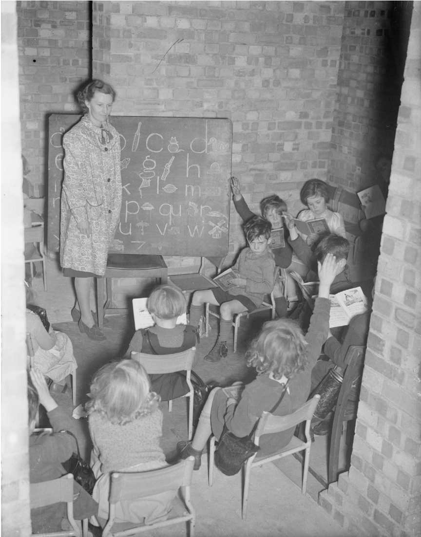
Figure 3.2 Lessons continue in the basement air raid shelter at Greek Road School, South East London. Several of the children are carrying their gas mask cases. © Imperial War Museum, D 3161.

Hanging over these restrictions was the memory of the bombing of Upper North Street School in Poplar in the First World War, when a 50kg bomb killed 18 young children and injured dozens more. School shelters, like the majority of public shelters, were designed to hold up to 50 people: the size restriction was an arbitrary one designed to limit mass-casualties in a direct