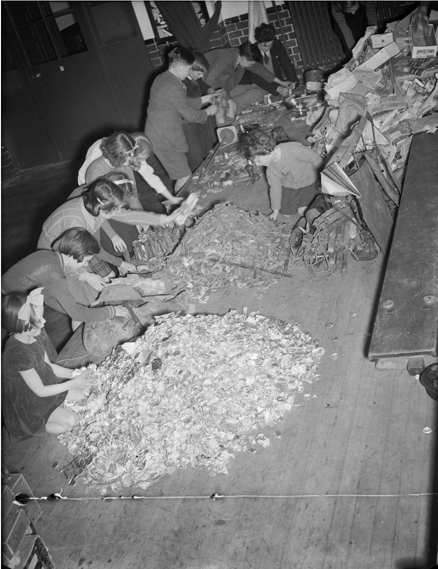
Figure 2.3 Pupils at Ancona Road School in South East London sort salvaged metal for recycling. Alongside milk bottle tops and sash window weights there is a heap of shrapnel fragments and a cluster of incendiary bomb tail fins. © Imperial War Museum, D 3166.

polishing and/or mounting the fragments, or turning them into trinkets of various kinds: 'I spotted a piece of shrapnel which turned out to be the nose cap of the shell. This I have kept ever since, highly polished, and have recently put it