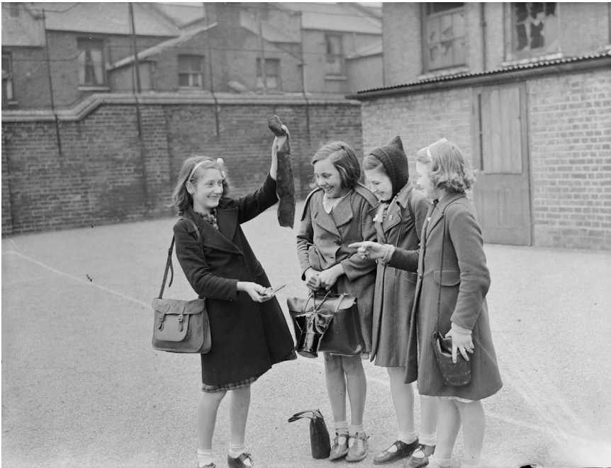
Figure 2.1 Pupils at Calvert Road School, South East London, admiring a fragment of metal collected after an air raid. Note gas mask cases. © Imperial War Museum, D 3160.

During my interviews with children of the Blitz, the significance of shrapnel collecting was highlighted by a number of intriguing factors and recurring themes: the roughly even numbers of men and women who remembered collecting shrapnel; the apparent near-universality of the practice and the vividness with which interviewees could remember individual items in their collections. Shrapnel collecting was evidently an important part of a wartime childhood, and